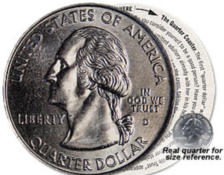
The quarter coaster is 4 inches in diameter.