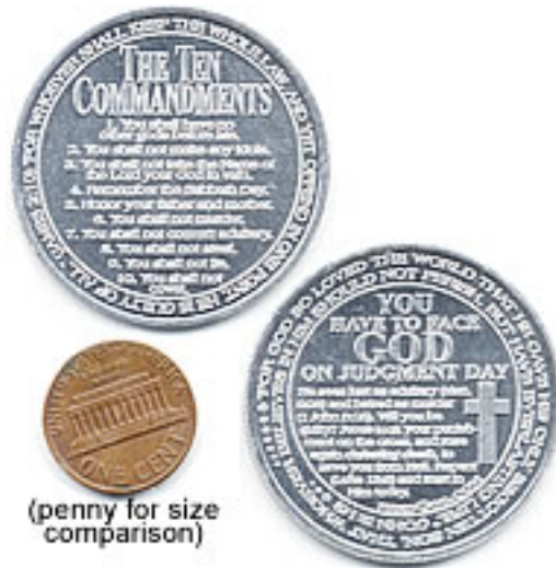
(penny for size comparison)

We've just had coins manufactured with the Ten Commandments on one side, and the Gospel on the other. As you can see, the text is small, but if you've been using the pressed pennies... you'll notice that the smallest text on the new coin is the same size you have now on the pressed penny. This bright aluminum coin can easily be read as you tilt it into the light. This is an excellent springboard into the Gospel, and a wonderful gift to give to the unsaved. They are 1½ inches in diameter-- 50 coins for $8.00 .